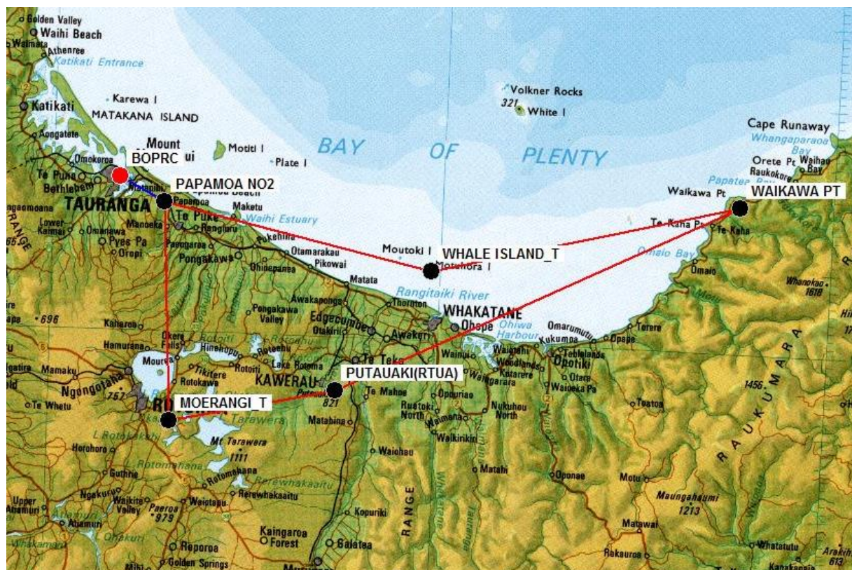
Figure 4: Proposed LMR Network