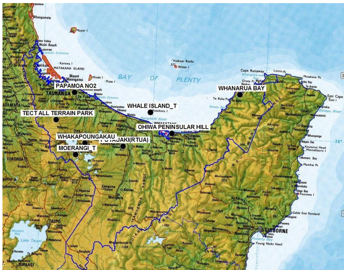
Figure 2: BOP CD/BAU Repeater Locations

The location of these sites is shown below.